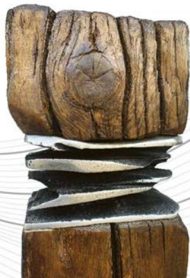
"KOOTOOK" Aluminium and wood 200x65x45 cm.