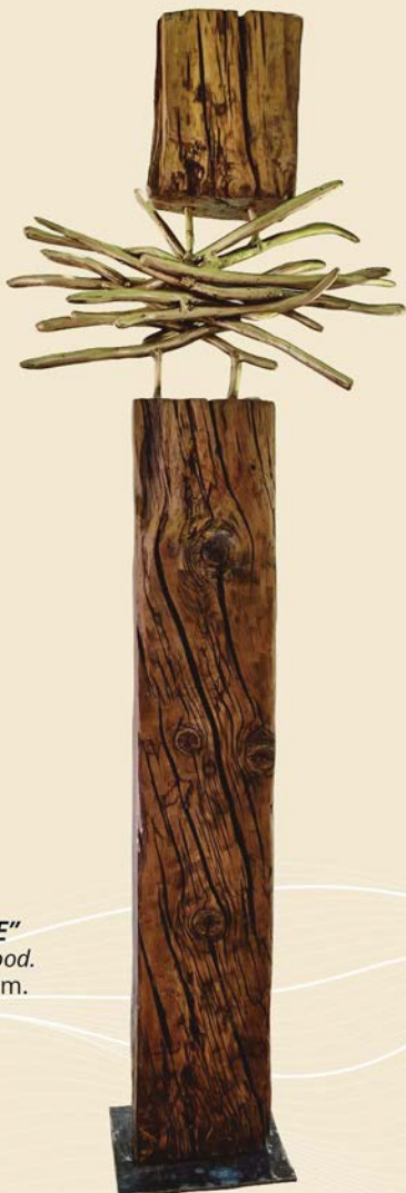
"FORTITUDE" Brass and wood. 187x65x28 cm.