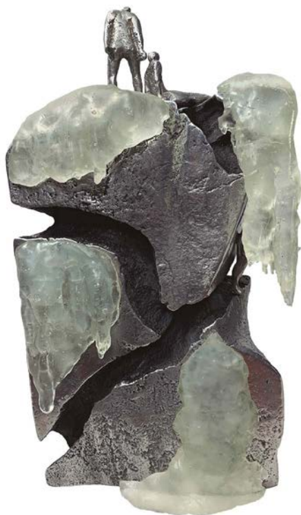
"NO WAY DOWN" Sand cast aluminium and cast glass. 45x30x10 deep cm.