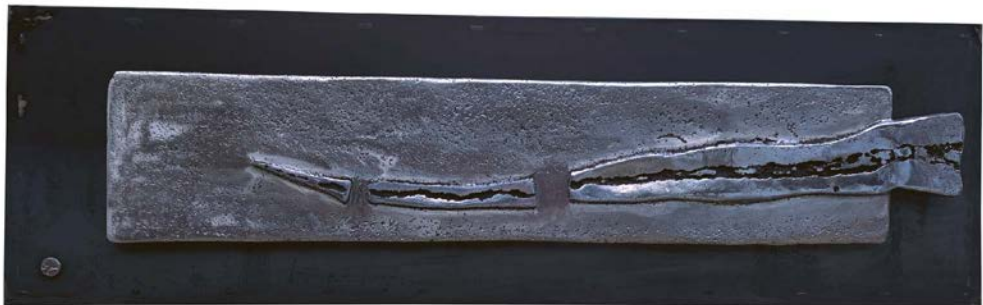
"ANTICLINE" Aluminium and steel. 45x150x8 cm.