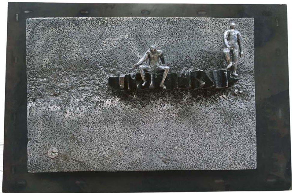
"OVERLOOK" Aluminium and steel. 60x40x20 cm.