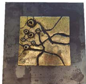
"STOPE BENCH" Brass and steel. 150x50x8 cm.