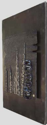
"LIGNITE" Aluminium and steel. 160x100x106 cm.