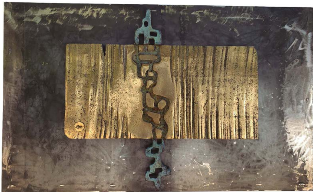
"CIRCUMFLEX" Brass and steel. 100x60x7 cm.