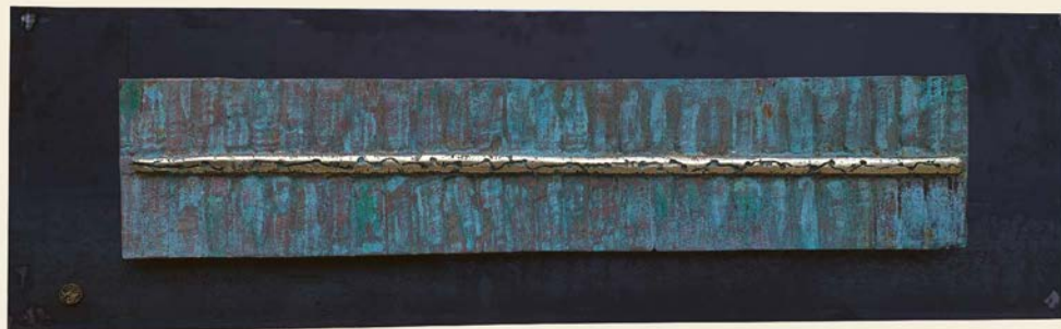
"FAULT LINE" Brass and steel. 150x45x8 cm.