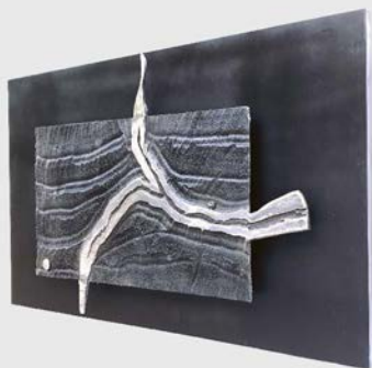
"HEAD WATERS" Aluminium and steel. 80x50x8 cm.