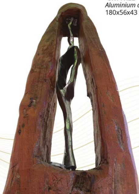
"SKYTREE" Aluminium and wood. 180x56x43 cm.