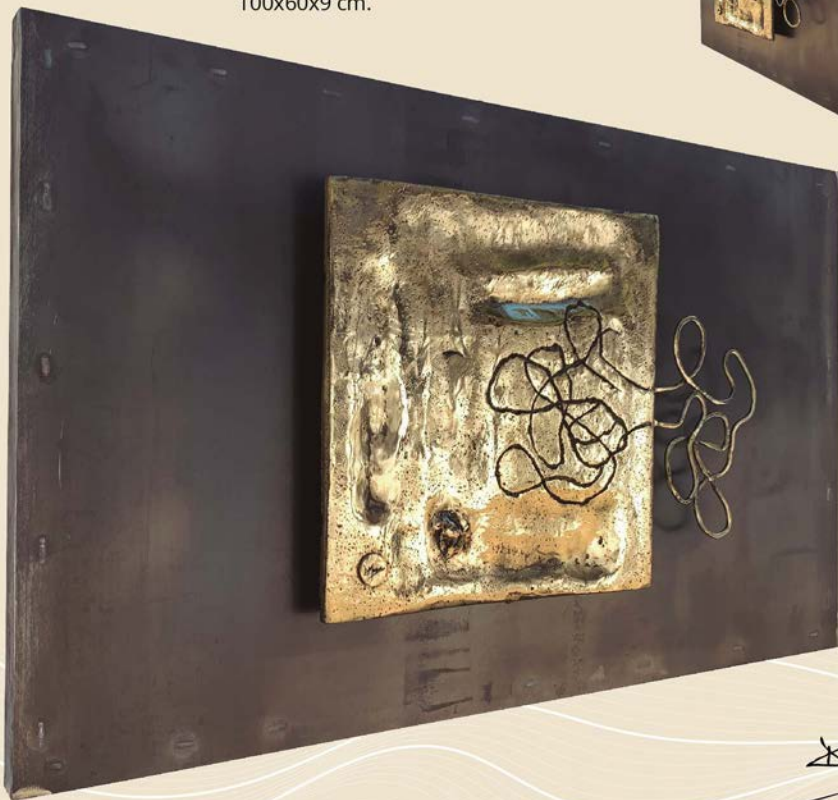
"ENTWINED" Brass and steel. 100x60x9 cm.